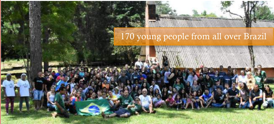
170 young people from all over Brazil