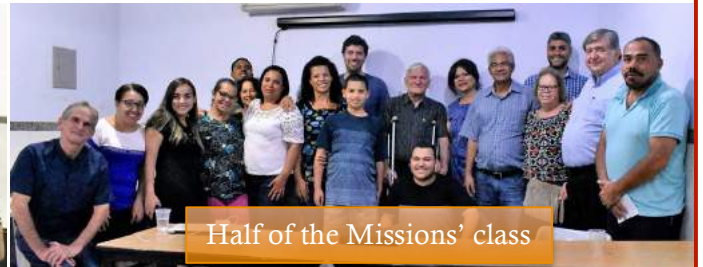
Half of the Missions' class