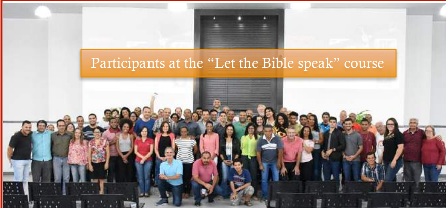
Participants at the "Let the Bible speak" course