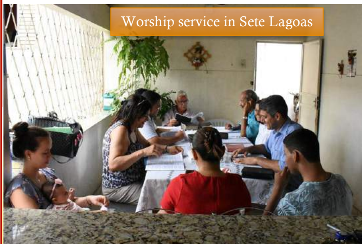
Worship service in Sete Lagoas