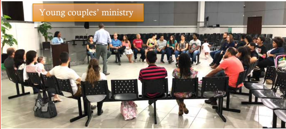
Young couples' ministry